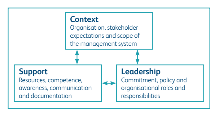
Figure 1: Scope and design components of management systems