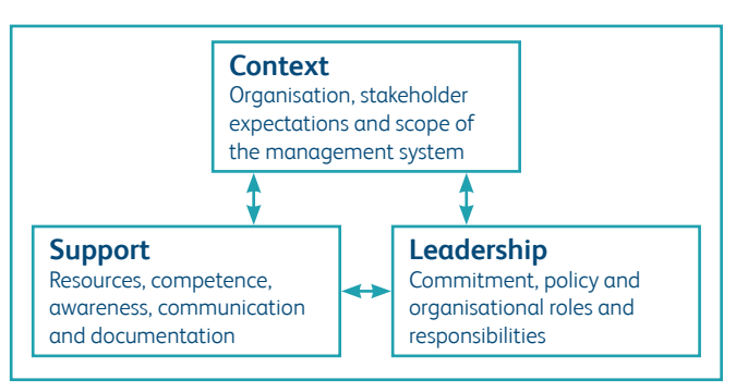
Figure 2: Control and develop components of management systems